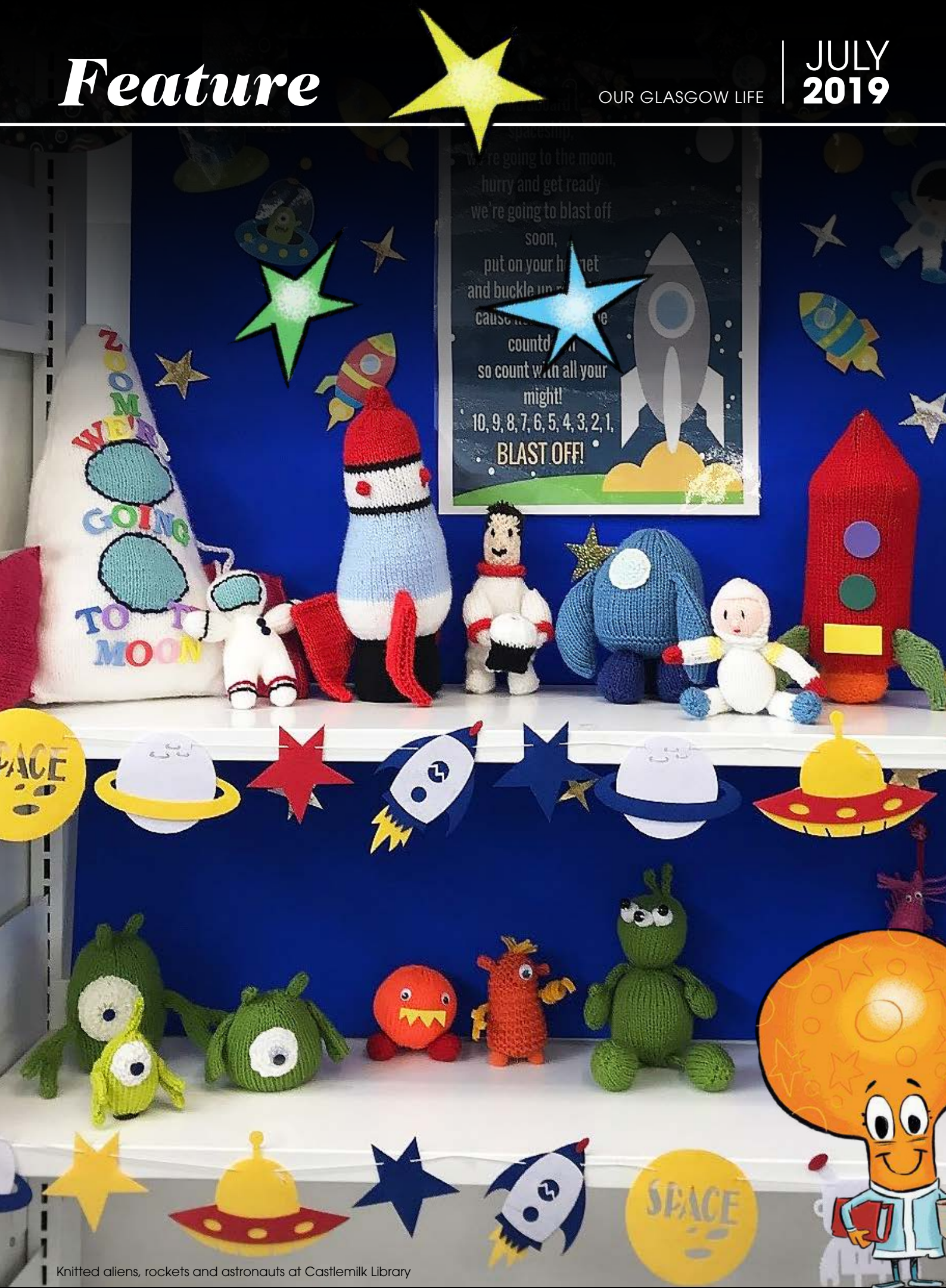
Knitted aliens, rockets and astronauts at Castlemilk Library