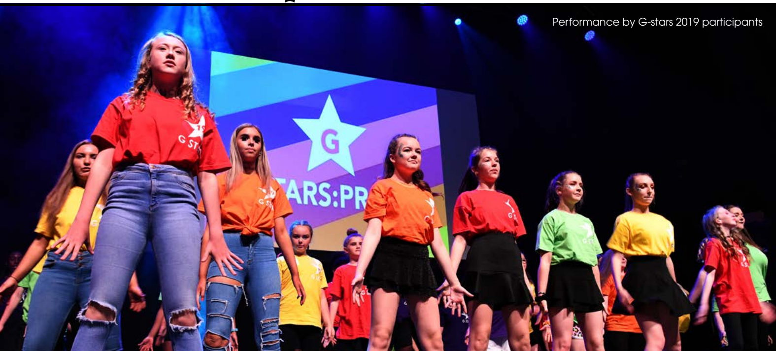
Performance by G-stars 2019 participants