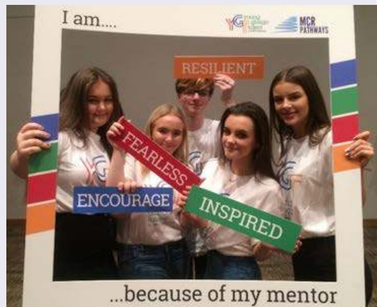
MCR Employability Pilot page 2