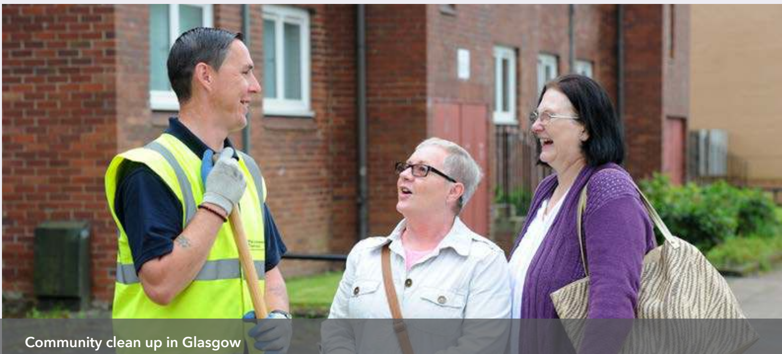
Community clean up in Glasgow

The Environmental Task Force can assist in organising a community clean up and community enforcement officers can be directed to pay extra attention to the area also.